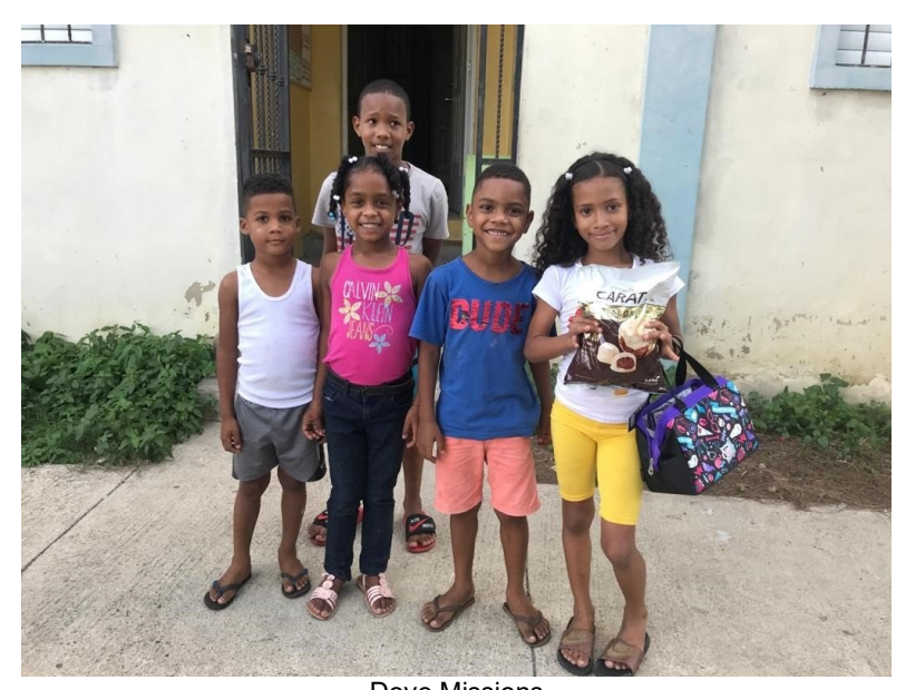
Dove Missions PO BOX 32074 Minneapolis, MN 55432 Email not displaying correctly? View it in your browser Unsubscribe